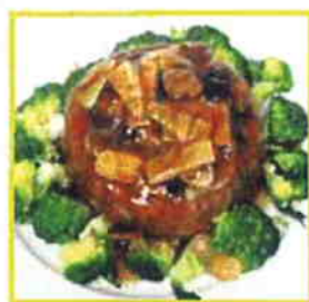
佛砵飄香蔬 Taro Ring in Supreme Vegetables