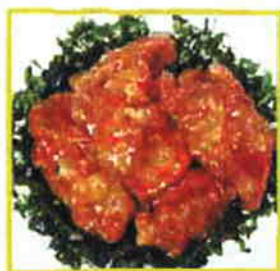
紅娘椒肉排 Dry Stir-fried Pork with a Touch of Honey & Chilli